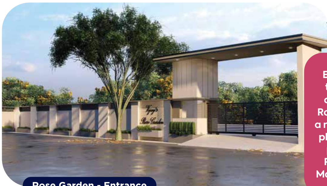
Rose Garden - Entrance

With over 15 years of expertise in the construction industry, Vijay Constructions specializes in creating both residential and commercial spaces. Based in Chennai, Tamil Nadu, the company has left its mark through numerous landmark projects. Guided by the ethos of delivering quality, long-lasting, and thoughtfully designed spaces, Vijay Constructions continues to redefine urban landscapes while prioritizing excellence in every detail.