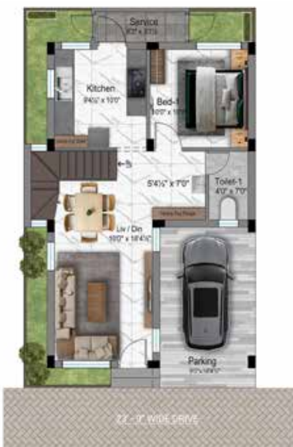
Site Cum Ground Floor